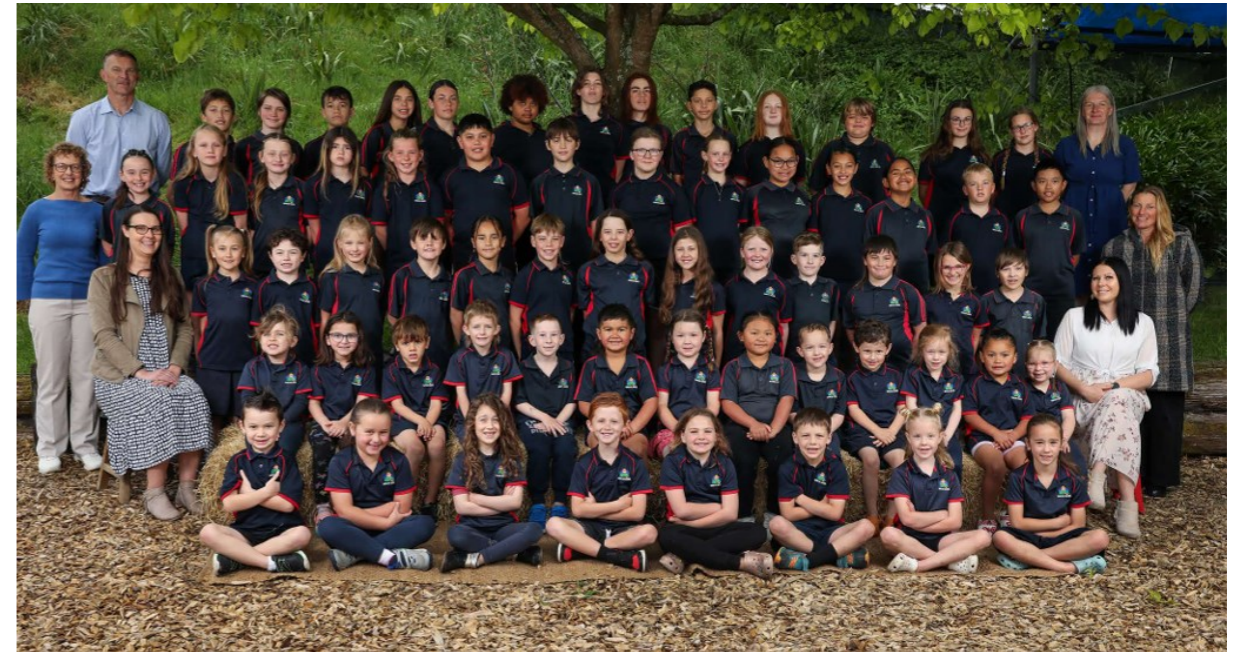
Our wonderful group of 2024 students and staff (with a couple absent).

Contact us on: 06 3296 856 School Cell: 0211666577 Principal: principal@bainesse.school.nz Office: officemanager@bainesse.school.nz Facebook: Bainesse School and Community Page School Policies: https://www.schooldocs.co.nz/ Search for your school / Username: bainesse Password: rural Taiwhenua hiranga. Taiwhenua taonga whakahī, Taiwhenua āhuatanga